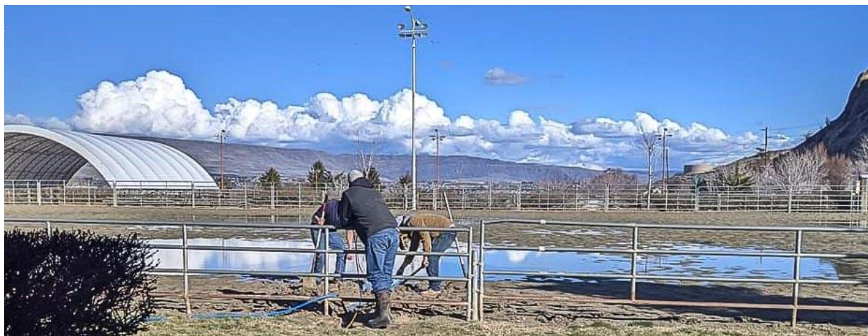
Our ground crew draining seasonal Lake Appleatchee

This is the first newsletter for a while, and we are hoping to get back to the normal first-of-the-month Horsefeathers. It will take some work to get members and divisions back in the habit of sending information and pictures to the office or to kmarch@nwi.net .